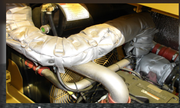
QSB-4.5 Liter Cummins Electronic Turbocharged Diesel Engine