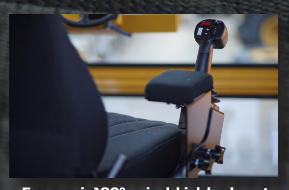
Ergonomic 180° swivel, high back seat with industry's only joystick controller