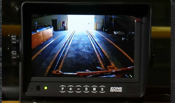
Video Camera Monitor