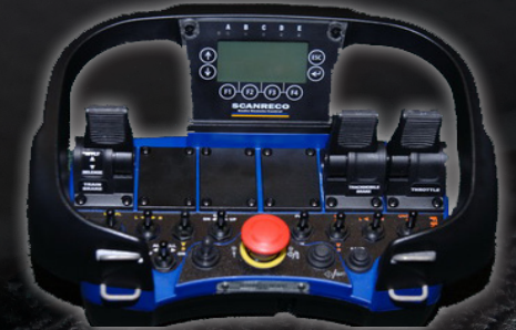
Radio Remote Control System