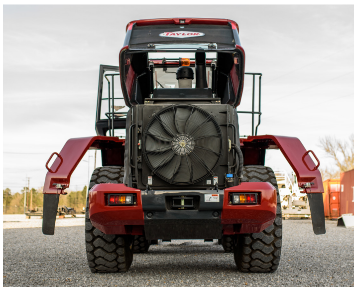
The rear full fenders swing out for easy access to the engine compartment. The electrically actuated, wide opening fiberglass hood of the Taylor T-1023 gives you easy access to the engine and its easy-to-reach service points. The radiator also swings out for ease of service.