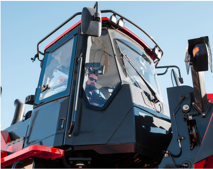
The Taylor T-1023 has been designed to offer optimized visibility. A panoramic view cab with curved front glass has been paired with well-positioned lift arms to allow the operator a clear line of sight to the attachment at ground level.