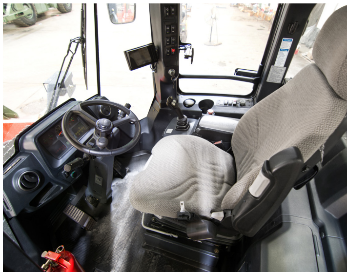
Ergonomically designed controls, increased visibility and convenient features all contribute to operator comfort and overall productivity on the jobsite. Air conditioning is standard