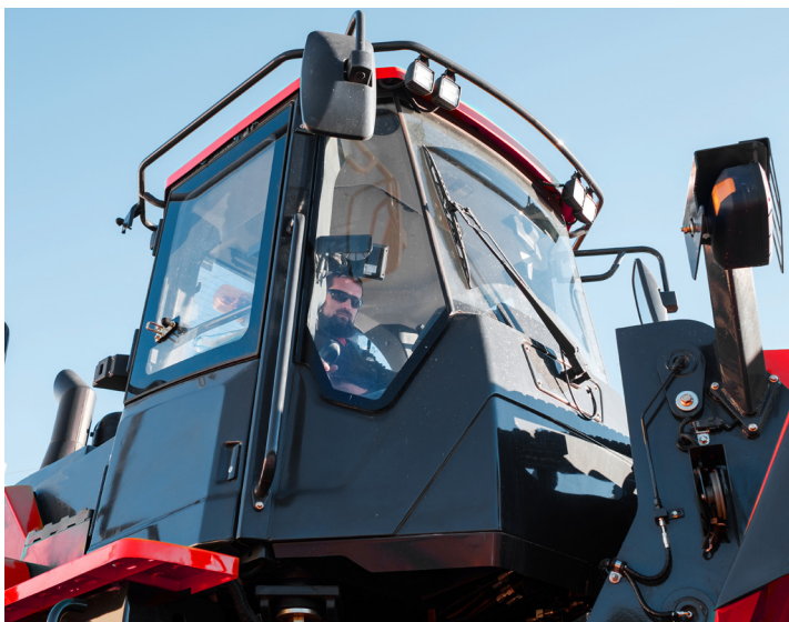
The Taylor T-1035 has been designed to offer optimized visibility. A panoramic view cab with curved front glass has been paired with well-positioned lift arms to allow the operator a clear line of sight to the attachment at ground level.