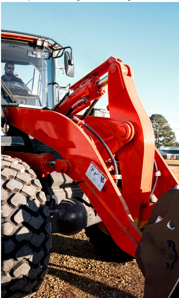
The Taylor T-1035 features optimized Z-Bar geometry that positions the bucket closer to the tires, achieving high bucket breakout forces with maximum rollback. The option of hydraulic quick coupler attachment adds versatility to Z-Bar machines, allowing use of multiple tools to suit the job-site needs.