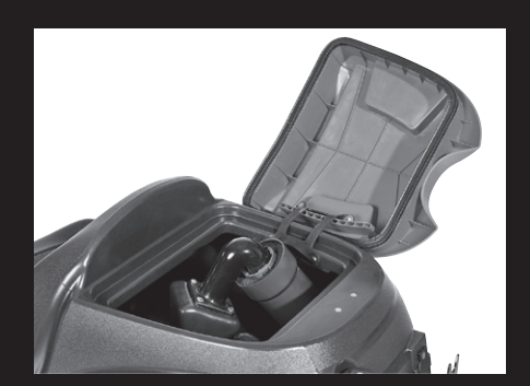
Large opening to the 19.2 gal (73 L) recovery tank allows easy cleaning.