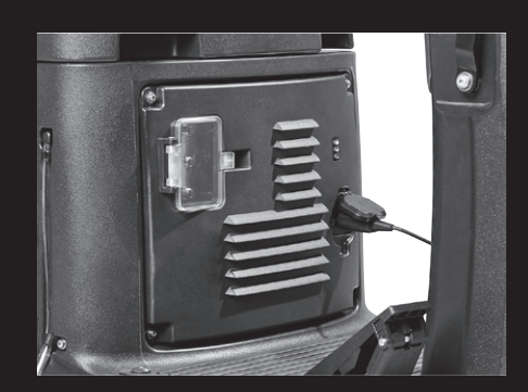
An integrated onboard charger enables easy plug-in and battery charge at any outlet.