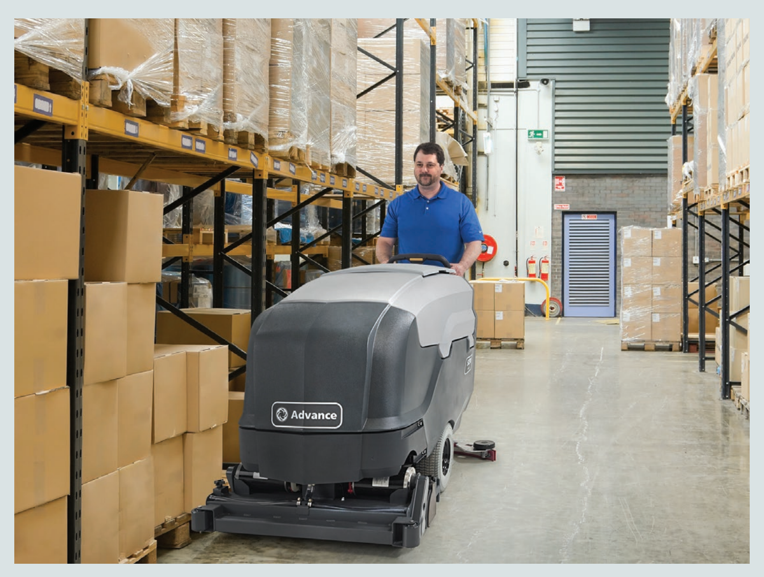
When it must get cleaned count on the SC900™ to get the job done.

With the Advance SC900<sup>™</sup>, there has never been a more solid and reliable path toward perfectly clean floors. The SC900 tackles your toughest cleaning challenges consistently, at the lowest possible cost.